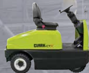
Electric Tow Tractor 4000 / 7000 kg