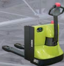
Low-lift Pallet Truck 2000 kg