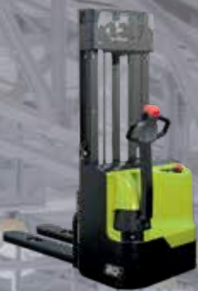
Pallet Stacker Multi-purpose Vehicle 2000 kg