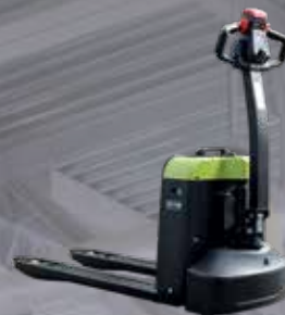
Low-lift Pallet Truck 1500 kg