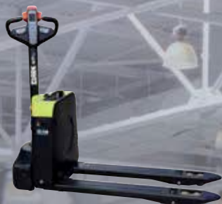
Low-lift Pallet Truck 1800 kg