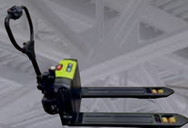
Low-lift Pallet Truck 1500 kg