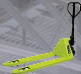
Hand Pallet Truck 2500 kg