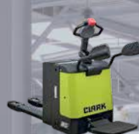
Low-lift Pallet Truck Platform version 2000 kg