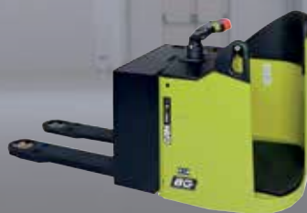
Low-lift Pallet Truck Platform version 2000 kg